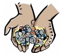
Tithes and offerings

"So, whether you eat or drink, or whatever you do, do all to the glory of God." 1 Corinthians 10:31